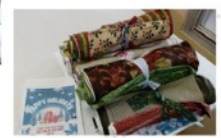
Members participated in a gift exchange and all who attended received a 3 fabric gift bundle from the guild.